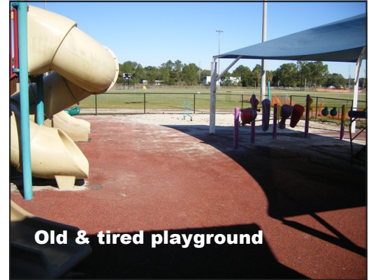
Old & tired playground

Sports and playground maintenance professionals love The TopCoat System for its durability and ease of installation. Just apply with an airless sprayer. Cleanup is quick with soap and water.