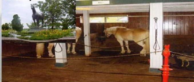
Kentucky Horse Park

Stalls, Aisles, Walkers, Wash Bays, Trailers, Ramps, Wall Liners and More!!!