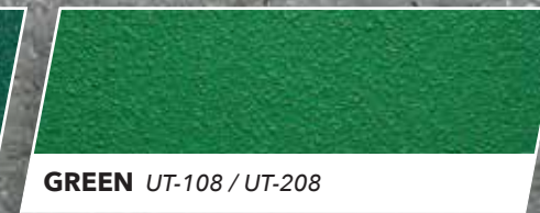
GREEN UT-108 / UT-208