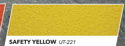
SAFETY YELLOW UT-221