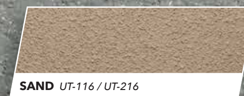
SAND UT-116 / UT-216