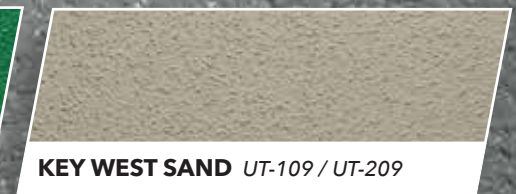
KEY WEST SAND UT-109 / UT-209