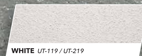
WHITE UT-119 / UT-219