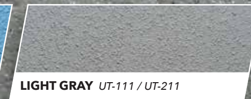
LIGHT GRAY UT-111 / UT-211