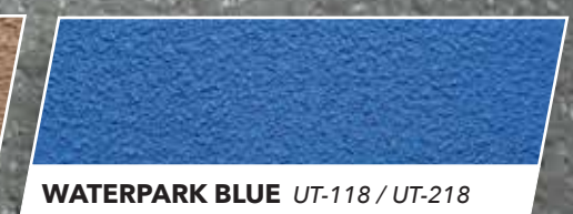
WATERPARK BLUE UT-118 / UT-218