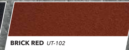
BRICK RED UT-102