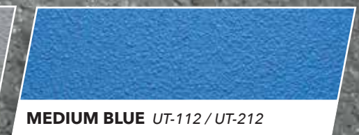
MEDIUM BLUE UT-112 / UT-212