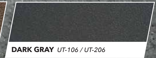
DARK GRAY UT-106 / UT-206