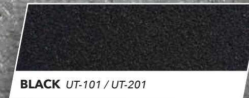
BLACK UT-101 / UT-201