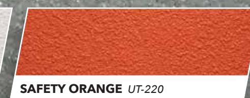
SAFETY ORANGE UT-220