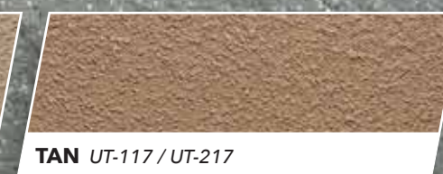
TAN UT-117 / UT-217