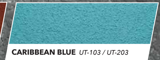
CARIBBEAN BLUE UT-103 / UT-203