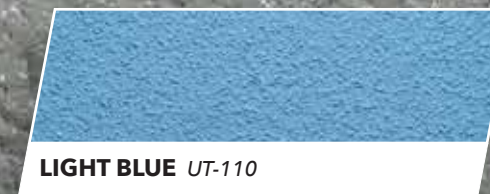
LIGHT BLUE UT-110