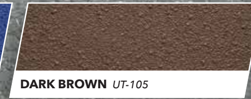
DARK BROWN UT-105