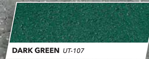
DARK GREEN UT-107