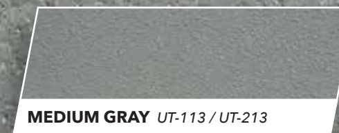
MEDIUM GRAY UT-113 / UT-213