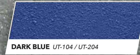
DARK BLUE UT-104 / UT-204