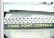
Descriptive messaging to reinforce Safety Programs