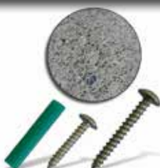
Screws and anchors for concrete installation