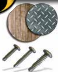
Self-tapping/drilling screws for wood and metal applications