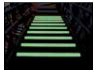
Glow-in-the-dark for safe egress