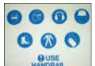
Personal Protective Equipment (PPE) symbols

*Safeguard Technology uses Fused Alumina Aggregate as a grit