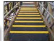
Two tone configuration to highlight the leading edge