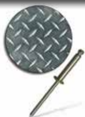
Pop rivets for quick metal installation