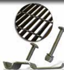
Saddle clips, nuts, and bolts are used for open grating installation applications