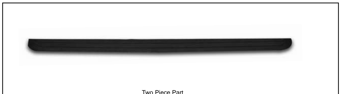
Two Piece Part