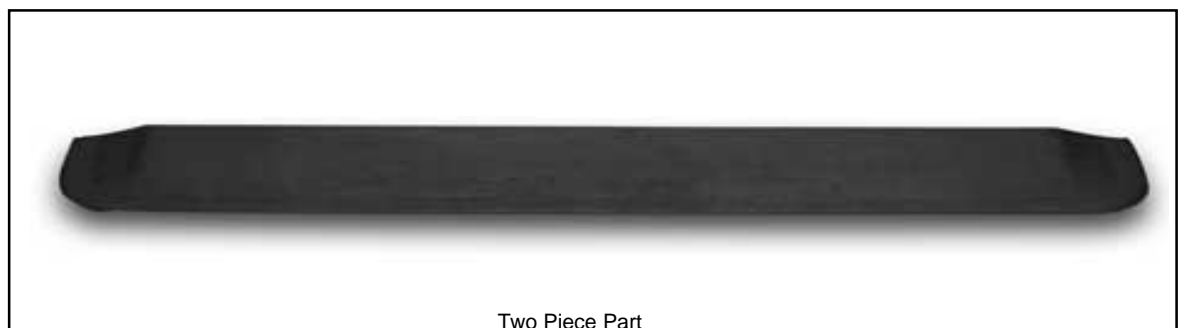
Two Piece Part