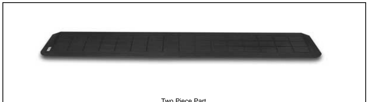
Two Piece Part