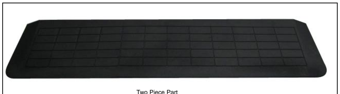
Two Piece Part